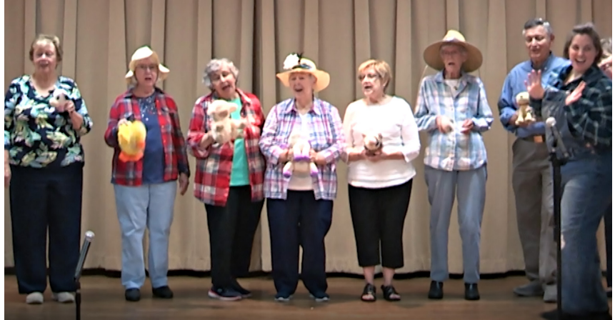
The AJJ performed Old MacDonald in the feast day "No Talent – Talent Show"

Making the Residents happy was all that mattered to St. Jeanne Jugan. We think she would love to see the smiles on our Residents' faces as they enjoyed our Annual "No Talent – Talent Show" performed in honor of the mission she began in 1839.