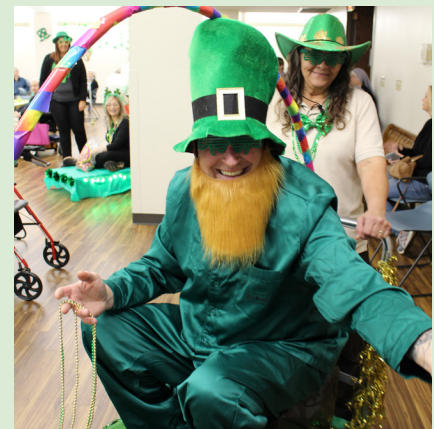
We celebrated celebrated a festive St. Patrick's Day with a parade and lots of green!