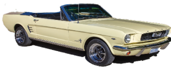
1966 Rotisserie Restored Ford Mustang 289ci-Automatic Convertible