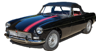
1962 Rotisserie Restored MG MGB Manual/Convertible

Proceeds from the Top Down Classic Cruiser Raffle WILL cover the cost of NEW Boilers for St. Joseph's Home. Now that's Providential!